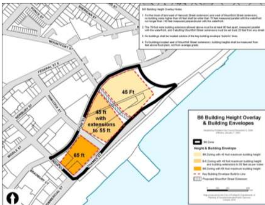
Figure 2, Current B-6 Height Overlay Zoning Map

Regarding the implementation of the associated Eastern Waterfront zoning, each of the five meetings that took place through October, November, and December 2004 included review of a map of the B-6 zone and the accompanying height overlay ( B-6 Building Height Overlay & Building Envelopes , Figure 2), referenced as Order 80-04/05. The creation of the B-6 zone and the B-6 Height Overlay map were the first steps in implementation of the Eastern Waterfront Comprehensive Plan documents. Both the extent of the B-6 zone and the height parameters of the B-6 zone were amended by the Council in November 2004, resulting in a height overlay zoning map that included a reference to flood plain for one of the building envelopes, east of Mountfort Street.